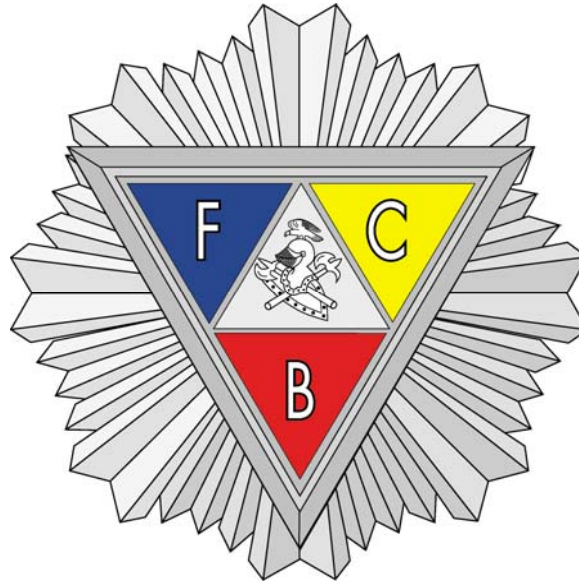
Knights of Pythias

From New York & Metropolitan Area: (2 Hours) George Washington Bridge to New Jersey Palisades Parkway to New York Thruway North. Proceed on Thruway to Exit 16 and proceed west on Route 17 to Exit 104. Route 17B (Raceway Road). Go West to Cochection 17 miles, at the blinking light turn right at the intersection on Route 17B West and 52A, then follow the signs to the Villa Roma.